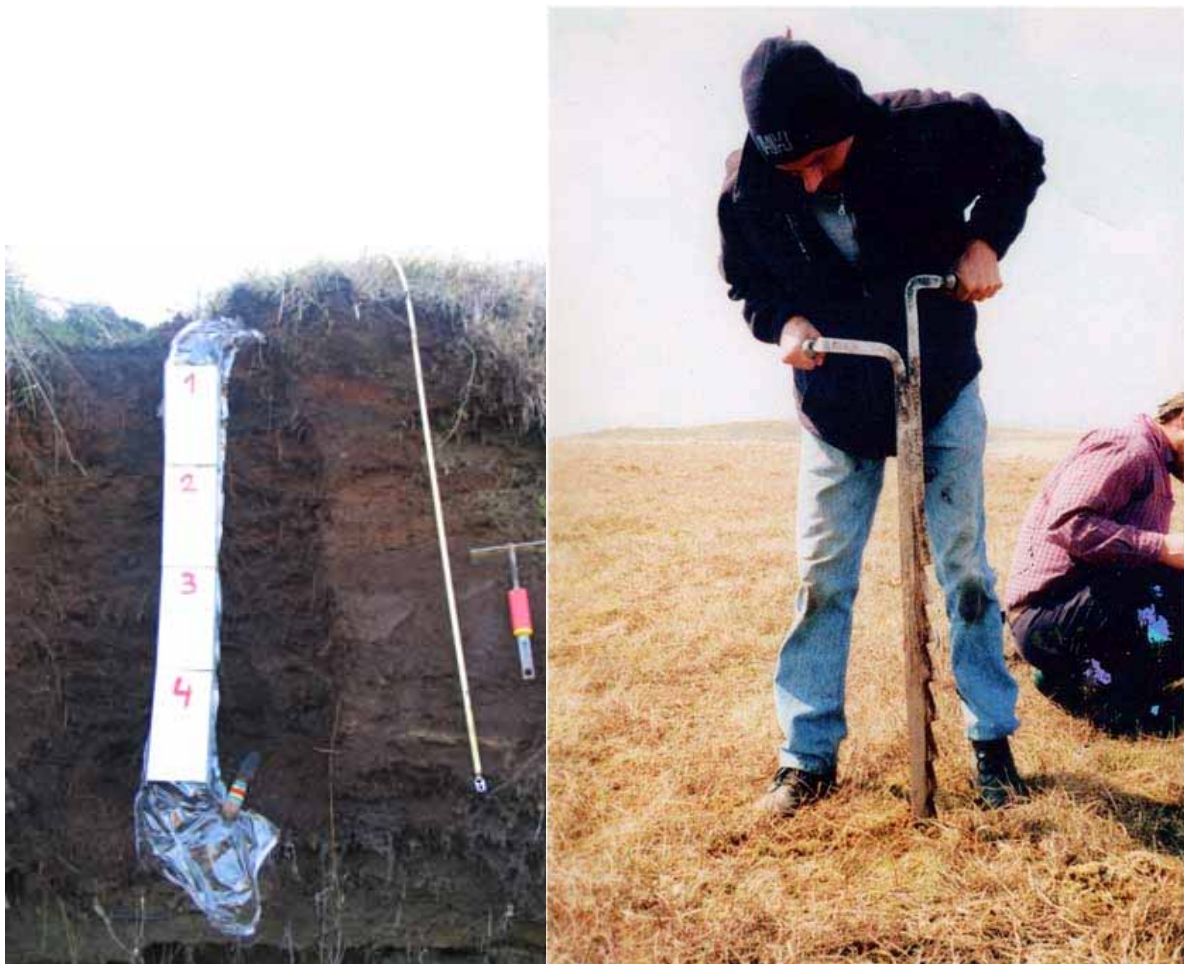
Figure 4. Left: collecting peat in north-east Iceland, from an exposed surface containing tephra. Note the difference in colour between the long-term exposed peat face (lighter, more oxidised) and the darker, newly cut surface. Right: using the peat cutter of Lageard et al. (1994) to cut a trench in a peatland. This type of cutter can also be used on peat hags.