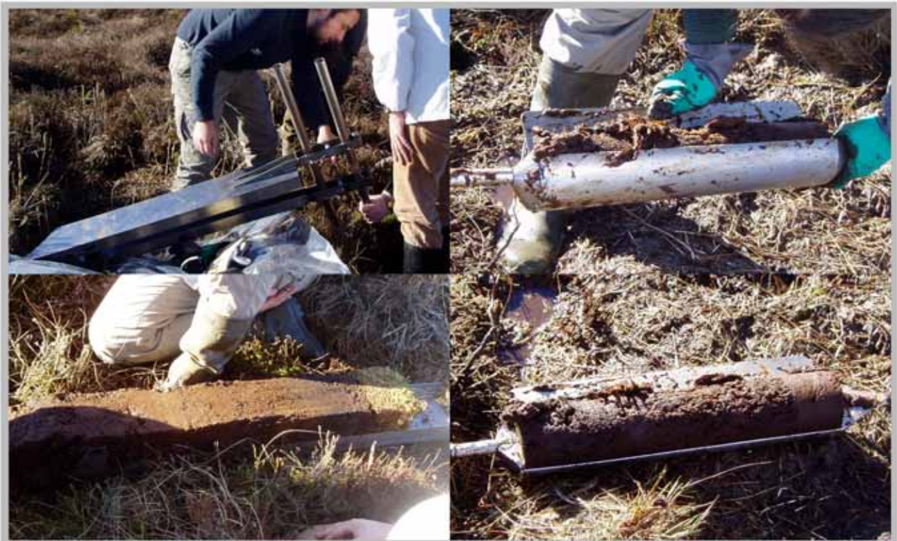
Figure 2. The two main types of corer that are used for sampling peat profiles. On the left, the Wardenaar corer and the peat monolith that can be retrieved with it. On the right, the Russian D-corer and the semi-cylindrical sample that it delivers.

To obtain a sample using a double-blade corer, the two blades are separated and one of them is pushed vertically into the peat to the required depth, cutting round only part of the monolith’s perimeter so that it is still partly supported by surrounding peat whilst the first cut is being made. The second blade is then inserted so that it cuts the remaining side(s) of the monolith; then the two blades are lifted together, with the monolith enclosed between them.