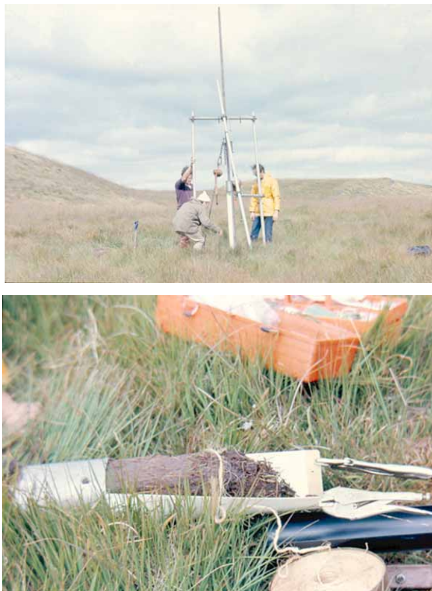
Figure 3. The large-capacity hand corer of Smith et al. (1968). Above: general view of the rig and corer in use; below: plastic liner containing a minimally compressed peat sample.

failure of the corer to penetrate the vegetation mat, it is recommended that the surface layers should be removed (i.e. sampled, as described in Section 3) before commencing the drive.